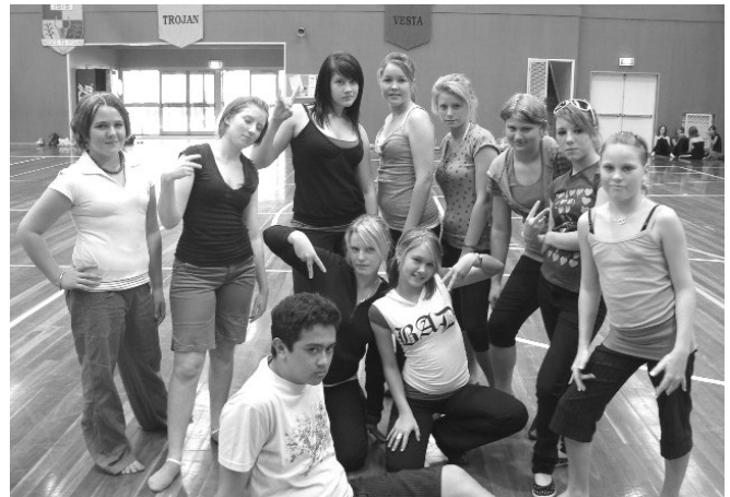
Some of the cast from the Rock Eisteddfod take a well-earned break at one of the many rehearsals of the last few months